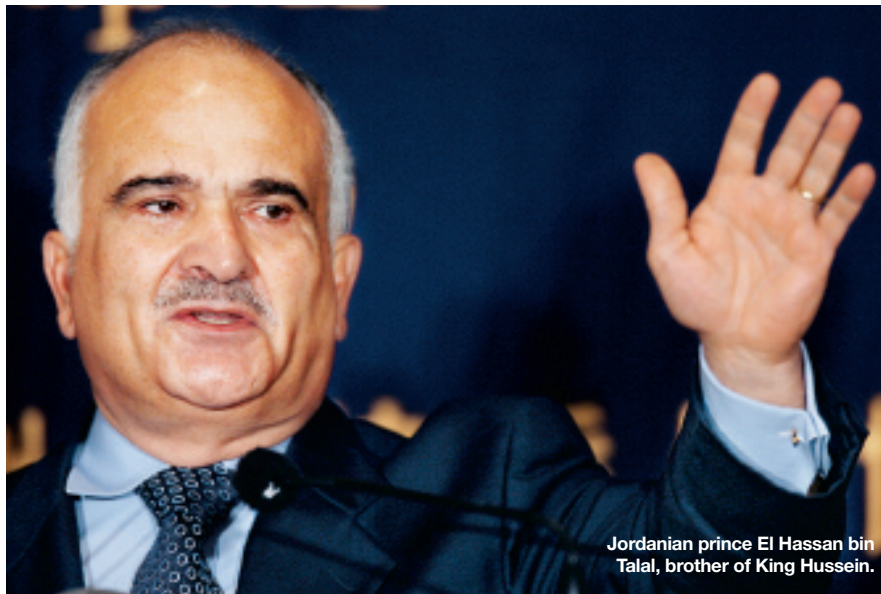
Jordanian prince El Hassan bin Talal, brother of King Hussein.

Jordan, the quip goes, is caught between Iraq and a hard place. For now, it embodies many of the issues that the Arab Human Development Report blamed for the region's intellectual malaise, among them lack of freedom and dysfunctional, authoritarian governments whose security services have too much say; the triumph of who-you-know advancement over merit-based promotion; and poor communication between researchers within the region. Educational opportunities are limited, especially for girls and women.